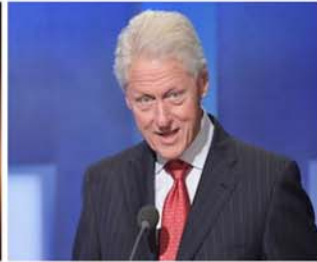
U.S Presidents Ranked from Worst to Best