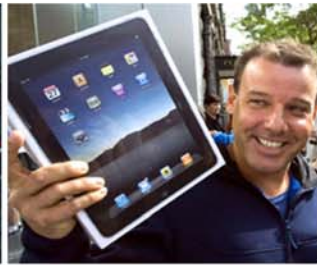
How New iPads are Selling for Under $40 firsttoknow.com