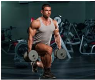
How to Quickly Boost Your Testosterone for Increased Performance firsttoknow.com