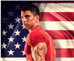
New Testosterone Booster Hits the Shelves howlifeworks.com