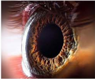
1 Odd Method Restores Your 20/20 Vision. Try This... Quantum Vision System